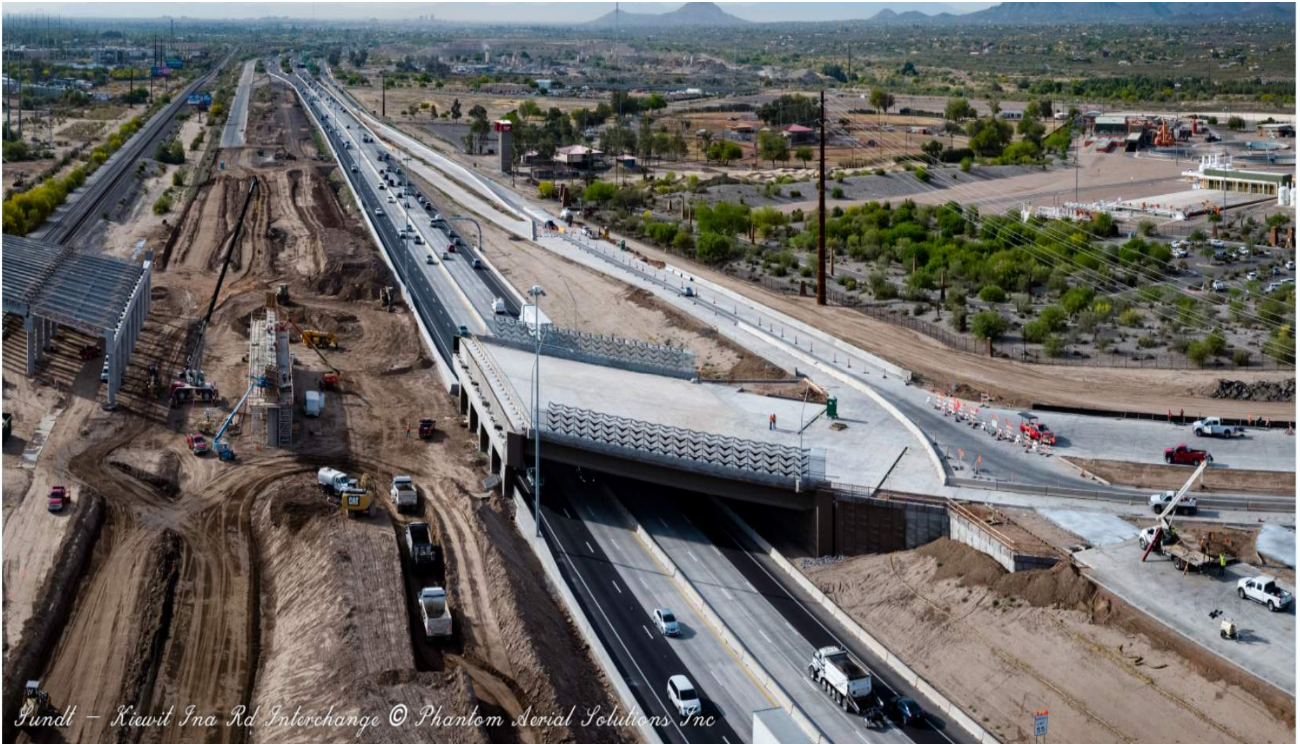
Sundt - Kiewit Ina Rd Interchange